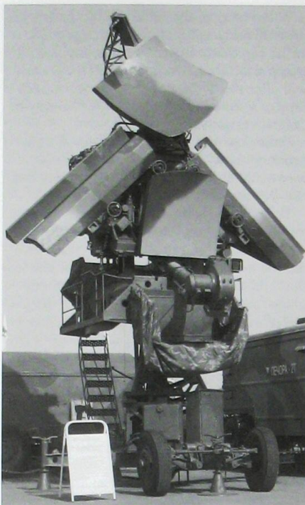
> This Pechora-2T radar is fitted with Tetraedr's new electro-optical sensors.

The modernised camera is 306 mm x 336 mm x 1,077 mm (width x height x length)